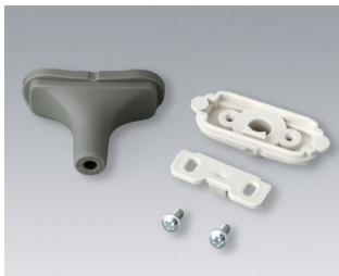
B2911318 Cable gland kit, 4.2 - 5.0 TPE volcano