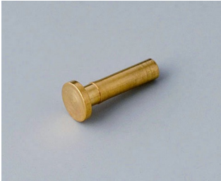
A9193030 Contact pin gold-plated