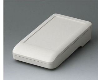
A9005117 DATEC-COMPACT S ASA+PC (UL 94 V-0) off-white RAL 9002 136x74x32mm IP 41