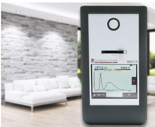
Spectral light meter