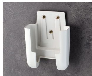
A9106627 Holder M ASA+PC (UL 94 V-0) off-white RAL 9002