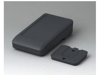
A9005218 DATEC-COMPACT S ASA+PC (UL 94 V-0) lava 136x74x32mm IP 41