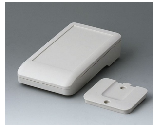
A9005217 DATEC-COMPACT S ASA+PC (UL 94 V-0) off-white RAL 9002 136x74x32mm IP 41