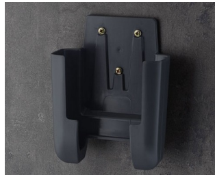
A9107628 Holder L ASA+PC (UL 94 V-0) lava