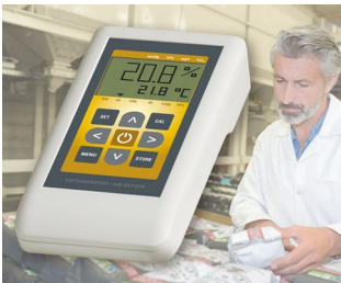
Atmospheric oxygen measuring unit