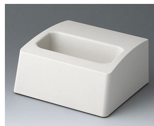
A9106507 Station M ASA+PC (UL 94 V-0) off-white RAL 9002