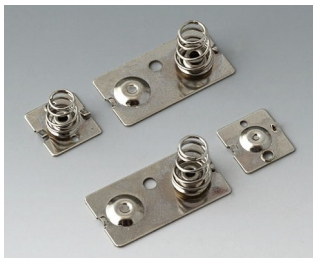
A9190023 Set of battery clips, 3 x AA Steel nickel-plated