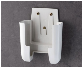
A9107627 Holder L ASA+PC (UL 94 V-0) off-white RAL 9002