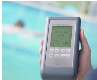
Electronic pool tester