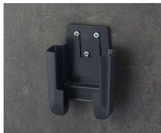
A9105628 Holder S ASA+PC (UL 94 V-0) lava