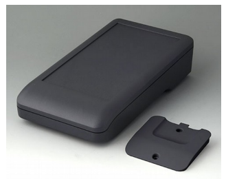
A9007218 DATEC-COMPACT L ASA+PC (UL 94 V-0) lava 206x110x47mm IP 41