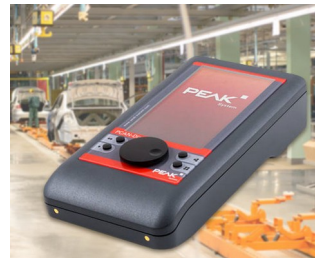
Mobile diagnostic device for CAN and CAN FD buses