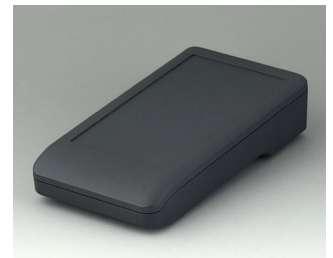
A9006118 DATEC-COMPACT M ASA+PC (UL 94 V-0) lava 172x92x39mm IP 41