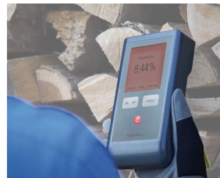
Wood moisture measuring device