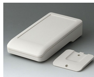
A9006217 DATEC-COMPACT M ASA+PC (UL 94 V-0) off-white RAL 9002 172x92x39mm IP 41