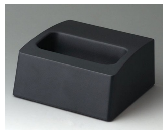
A9106508 Station M ASA+PC (UL 94 V-0) lava