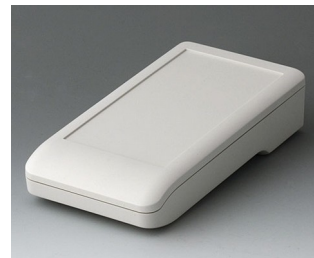
A9006117 DATEC-COMPACT M ASA+PC (UL 94 V-0) off-white RAL 9002 172x92x39mm IP 41