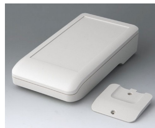
A9007217 DATEC-COMPACT L ASA+PC (UL 94 V-0) off-white RAL 9002 206x110x47mm IP 41