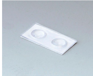
A9207150 Anti-slide feet 6.5 x 2 mm transparent

Subject to technical modification without notice. © by OKW Gehäusesysteme, Buchen/Germany.