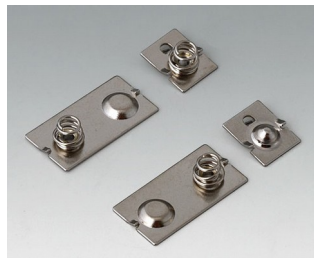
A9190024 Set of battery clips, 3 x AAA Steel nickel-plated