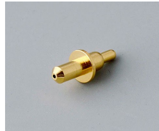
A9193031 Spring contact gold-plated