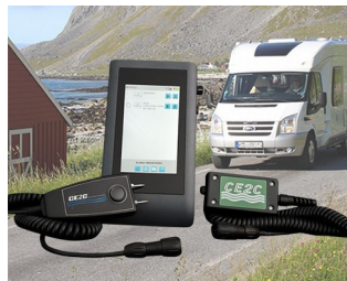
System for leak detection in leisure vehicles