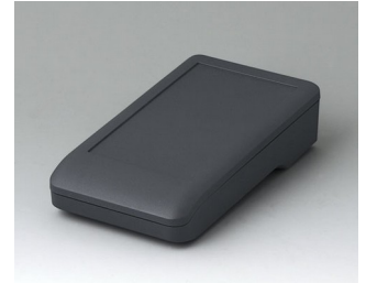
A9005118 DATEC-COMPACT S ASA+PC (UL 94 V-0) lava 136x74x32mm IP 41