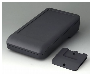
A9007208 DATEC-COMPACT L ASA+PC (UL 94 V-0) lava 206x110x47mm IP 65