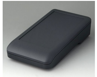
A9007118 DATEC-COMPACT L ASA+PC (UL 94 V-0) lava 206x110x47mm IP 41