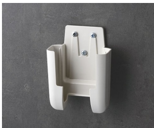
A9105627 Holder S ASA+PC (UL 94 V-0) off-white RAL 9002