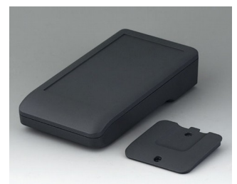
A9006218 DATEC-COMPACT M ASA+PC (UL 94 V-0) lava 172x92x39mm IP 41