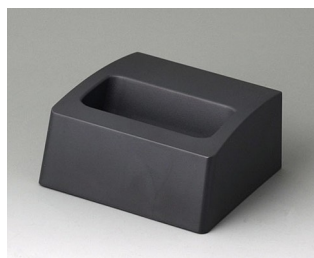
A9105508 Station S ASA+PC (UL 94 V-0) lava