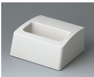
A9105507 Station S ASA+PC (UL 94 V-0) off-white RAL 9002