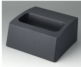
A9107508 Station L ASA+PC (UL 94 V-0) lava