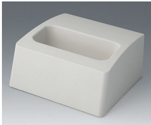
A9107507 Station L ASA+PC (UL 94 V-0) off-white RAL 9002