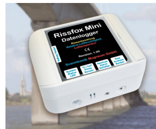
Miniature data logger for crack displacements and climatic data