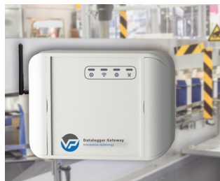
Data logger for machine monitoring