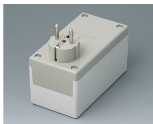
A9021665 PLUG CASE F / D, Vers. I PC+ABS (UL 94 V-0) pebble grey RAL 7032 120x65x65mm