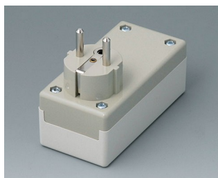
A9011665 PLUG CASE F / D, Vers. I PC+ABS (UL 94 V-0) off-white RAL 9002 100x50x40mm