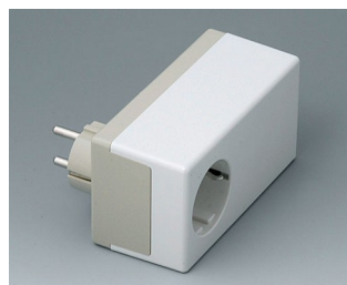
A9022465 PLUG CASE D, Vers. II PC+ABS (UL 94 V-0) pebble grey RAL 7032 120x65x55mm