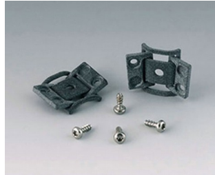
C8100360 Internal hinge set