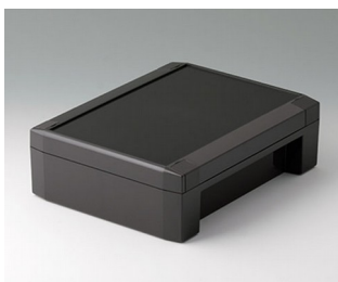
C8017221 SOLID-BOX 175 PC+ABS (UL 94 V-0) anthracite grey RAL 7016 225x175x70mm IP 66, IP 67, IK 08