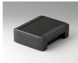
C8014181 SOLID-BOX 145 PC+ABS (UL 94 V-0) anthracite grey RAL 7016 180x145x60mm IP 66, IP 67, IK 08