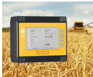
Data recording for harvesters