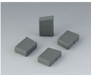
C8100188 Set of enclosure feet SEBS (TPE) volcano

Subject to technical modification without notice. © by OKW Gehäusesysteme, Buchen/Germany.