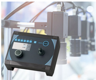
Camera control in production