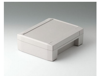
C8014182 SOLID-BOX 145 PC+ABS (UL 94 V-0) light grey RAL 7035 180x145x60mm IP 66, IP 67, IK 08