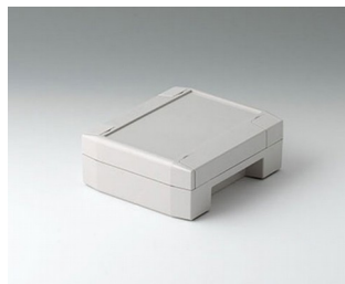
C8011132 SOLID-BOX 115 PC+ABS (UL 94 V-0) light grey RAL 7035 135x115x50mm IP 66, IP 67, IK 08