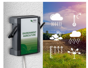
Weather station in agriculture