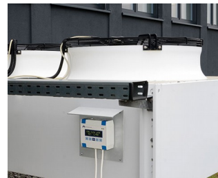
Heating/air conditioning/ventilation control