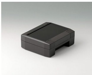
C8011131 SOLID-BOX 115 PC+ABS (UL 94 V-0) anthracite grey RAL 7016 135x115x50mm IP 66, IP 67, IK 08