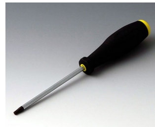
A0399T20 Torx T20 screwdriver