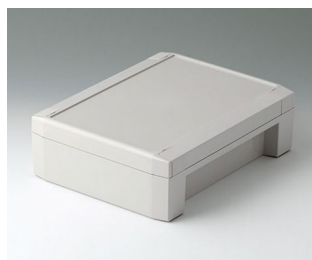
C8017222 SOLID-BOX 175 PC+ABS (UL 94 V-0) light grey RAL 7035 225x175x70mm IP 66, IP 67, IK 08