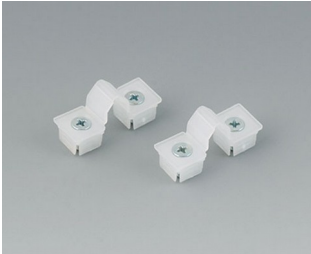
C2299031 Securing hinge for the cover PP natural-coloured