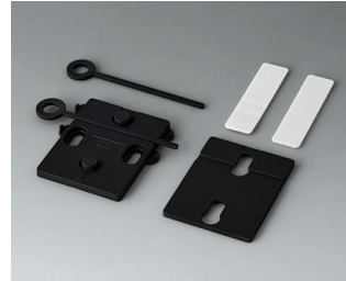
A9305019 Wall suspension elements ASA+PC (UL 94 V-0) black RAL 9005