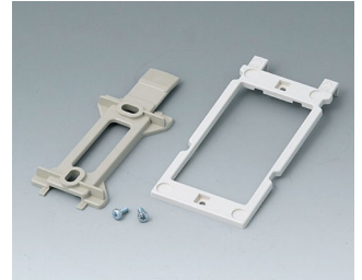
B1350048 Wall suspension elements ABS (UL 94 HB) pebble grey RAL 7032