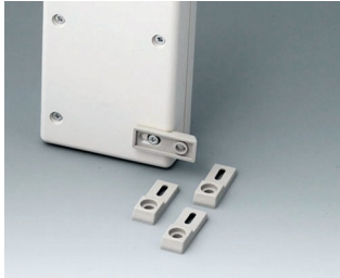
A9204108 Wall mounting brackets PA 6 pebble grey RAL 7032