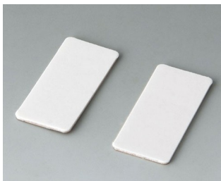
A9305147 Adhesive foil holder

Subject to technical modification without notice. © by OKW Gehäusesysteme, Buchen/Germany.