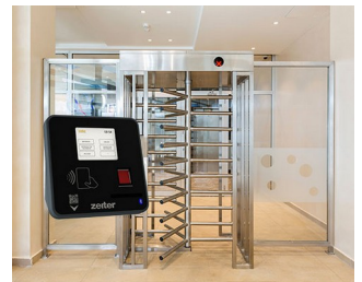
Terminal for access control