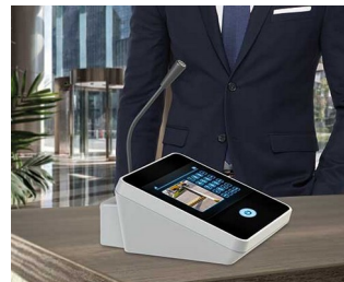
Table microphone / inter phone