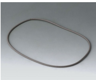
B4514030 Sealing 140