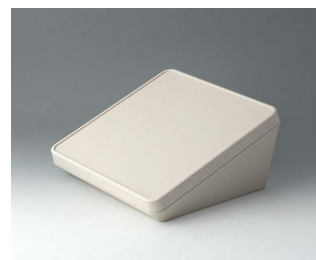
B4422107 PROTEC 220, Vers. I ASA+PC (UL 94 V-0) off-white RAL 9002 220x220x108mm IP 65 opt.