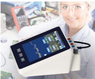
Multimeter measuring device