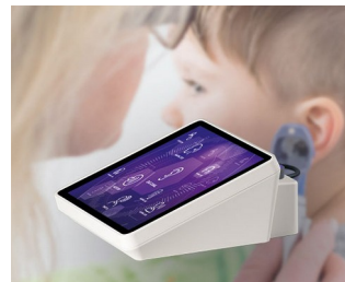
Hearing test device