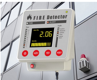
Terminal for fire alarm systems