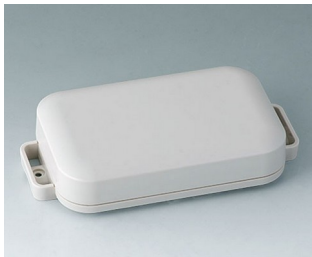
C3207107 EASYTEC 125 ASA+PC (UL 94 V-0) off-white RAL 9002 147x78x30mm IP 65 opt., IP 40