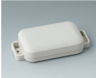
C3204107 EASYTEC 80 ASA+PC (UL 94 V-0) off-white RAL 9002 101x50x22mm IP 65 opt., IP 40