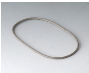
A9500030 Sealing 80