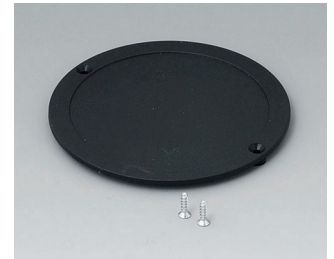
B5011849 Lid ABS (UL 94 HB) black RAL 9005