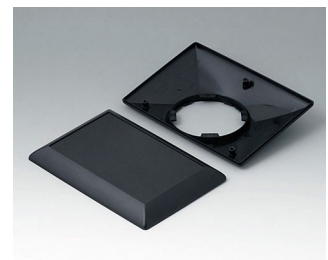
B5017209 Bottom and top part E160 F ABS (UL 94 HB) black RAL 9005 160x110x38mm