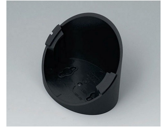
B5011319 Base 55° ABS (UL 94 HB) black RAL 9005