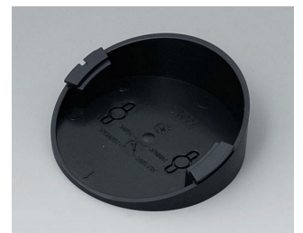
B5011219 Base 30° ABS (UL 94 HB) black RAL 9005