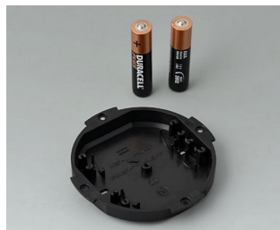
B5111109 Battery compartment, 2 x AAA ABS (UL 94 HB) black RAL 9005