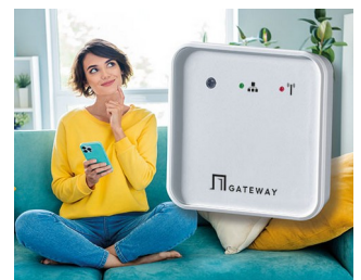
Smart home gateway