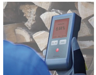
Wood moisture measuring device