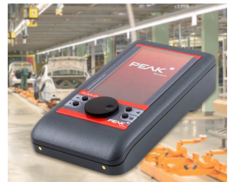
Mobile diagnostic device for CAN and CAN FD buses