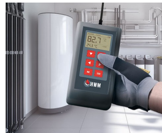
Measuring device for heating water