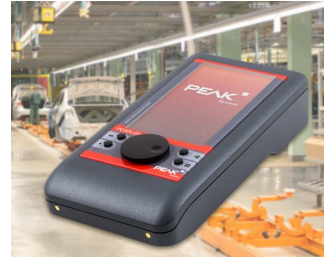
Mobile diagnostic device for CAN and CAN FD buses