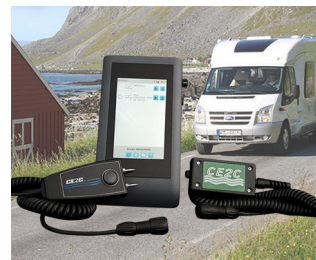
System for leak detection in leisure vehicles