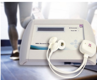
WBA receiver unit for measuring biosignals