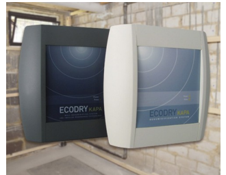
Systems for drying brickwork