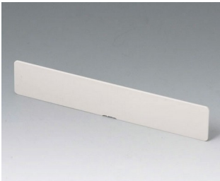
A9194007 Slot-in panel ABS (UL 94 HB) off-white RAL 9002 156x30x3mm