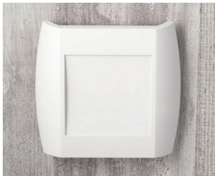
A9092107 DIATEC XS ABS (UL 94 HB) off-white RAL 9002 150x37x155mm IP 40