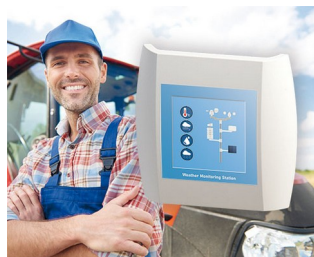
Weather Monitoring Station