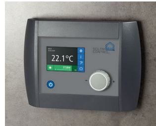
Solar Control Panel