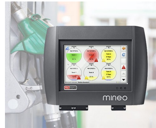
Controller for intelligent tank management