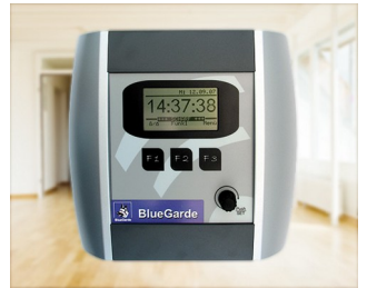
House control unit