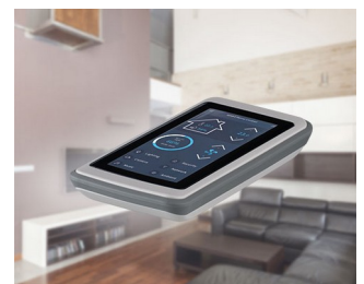
Smart Home Control