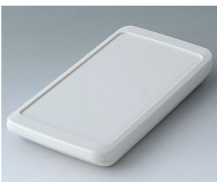
B5403307 SLIM-CASE M, Vers. III ASA+PC (UL 94 V-0) off-white RAL 9002 148x74x19mm IP 65 opt., IP 40