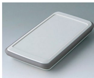
B5403317 SLIM-CASE M, Vers. VI ASA+PC (UL 94 V-0) off-white RAL 9002 148x74x22mm IP 54