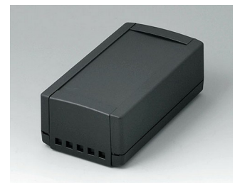
B1060469 TOPTEC 154 H, Vers. II ABS (UL 94 HB) black RAL 9005 154x84x56mm IP 40