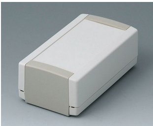
B1050365 TOPTEC 123 H, Vers. I ABS (UL 94 HB) off-white RAL 9002 123x68x45mm IP 40