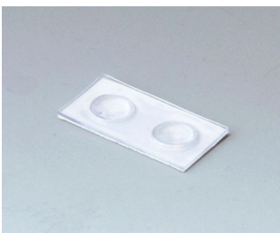
A9207150 Anti-slide feet 6.5 x 2 mm transparent

Subject to technical modification without notice. © by OKW Gehäusesysteme, Buchen/Germany.