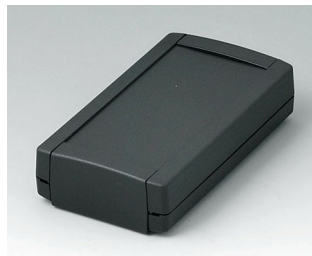
B1055369 TOPTEC 123 F, Vers. I ABS (UL 94 HB) black RAL 9005 123x68x30mm IP 40