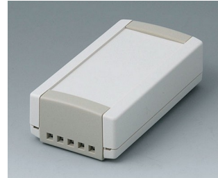
B1040465 TOPTEC 102, Vers. II ABS (UL 94 HB) off-white RAL 9002 102x54x30mm IP 40