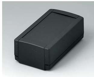
B1050369 TOPTEC 123 H, Vers. I ABS (UL 94 HB) black RAL 9005 123x68x45mm IP 40