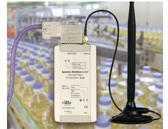
PROFIBUS radio system