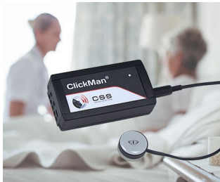
Adaptive multicontroller for single sensors

Universal enclosures for electronic and electro-technical devices. For example, monitoring purposes as check instruments, signalling equipment and control systems, medical and wellness devices, laboratory technology, computer peripherals and IoT/IIoT.