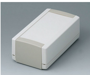
B1060365 TOPTEC 154 H, Vers. I ABS (UL 94 HB) off-white RAL 9002 154x84x56mm IP 40