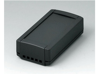
B1040469 TOPTEC 102, Vers. II ABS (UL 94 HB) black RAL 9005 102x54x30mm IP 40