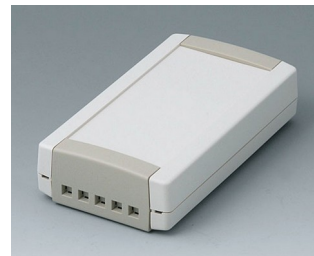
B1055465 TOPTEC 123 F, Vers. II ABS (UL 94 HB) off-white RAL 9002 123x68x30mm IP 40