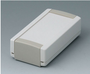
B1040365 TOPTEC 102, Vers. I ABS (UL 94 HB) off-white RAL 9002 102x54x30mm IP 40