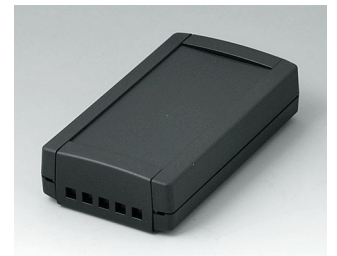
B1055469 TOPTEC 123 F, Vers. II ABS (UL 94 HB) black RAL 9005 123x68x30mm IP 40