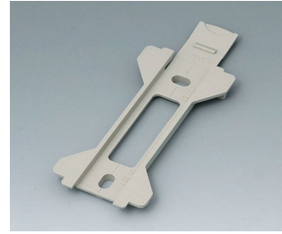
B1360028 Wall suspension element for Toptec 154 PC+ABS (UL 94 V-0) pebble grey RAL 7032