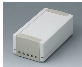
B1060465 TOPTEC 154 H, Vers. II ABS (UL 94 HB) off-white RAL 9002 154x84x56mm IP 40