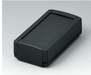
B1040369 TOPTEC 102, Vers. I ABS (UL 94 HB) black RAL 9005 102x54x30mm IP 40