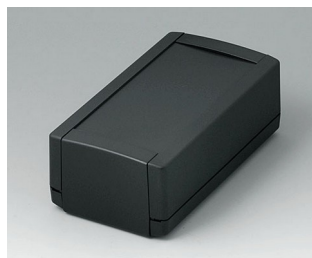
B1060369 TOPTEC 154 H, Vers. I ABS (UL 94 HB) black RAL 9005 154x84x56mm IP 40