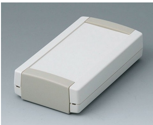
B1055365 TOPTEC 123 F, Vers. I ABS (UL 94 HB) off-white RAL 9002 123x68x30mm IP 40