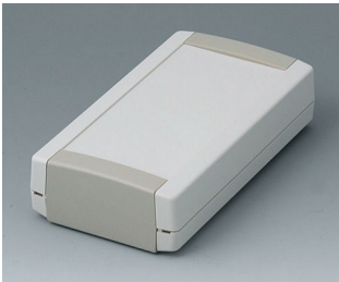
B1065365 TOPTEC 154 F, Vers. I ABS (UL 94 HB) off-white RAL 9002 154x84x38mm IP 40