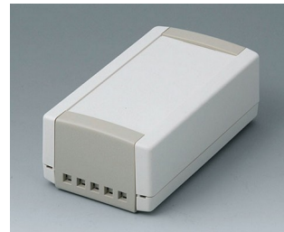
B1050465 TOPTEC 123 H, Vers. II ABS (UL 94 HB) off-white RAL 9002 123x68x45mm IP 40