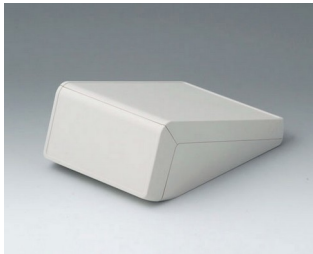
B4054107 UNITEC S, 0.6/0.6 ABS (UL 94 HB) off-white RAL 9002 125x177x69mm IP 40