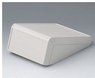
B4056117 UNITEC M, 1.4/1.4 ABS (UL 94 HB) off-white RAL 9002 148x210x80mm IP 40