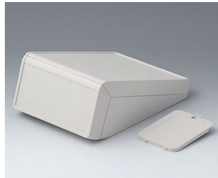
B4056217 UNITEC M, 1.4/1.4 ABS (UL 94 HB) off-white RAL 9002 148x210x80mm IP 40