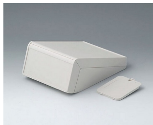
B4054217 UNITEC S, 1.4/1.4 ABS (UL 94 HB) off-white RAL 9002 125x177x69mm IP 40