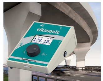
Ultrasonic measuring device