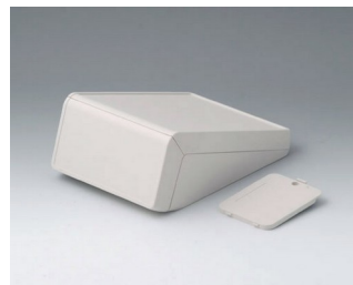
B4054237 UNITEC S, 0.6/1.4 ABS (UL 94 HB) off-white RAL 9002 125x177x69mm IP 40