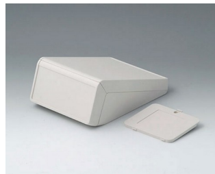
B4054327 UNITEC S, 1.4/0.6 ABS (UL 94 HB) off-white RAL 9002 125x177x69mm IP 40