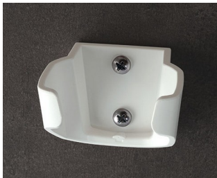
B2903037 Holder M ASA (UL 94 HB) traffic white RAL 9016