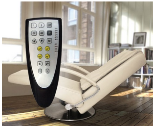
Control unit for Relax and Massage Chairs

Ideal for design-oriented hand control units. Many different types of remote control systems. Specially made for the medical and social fields as well as in the household and in industry.