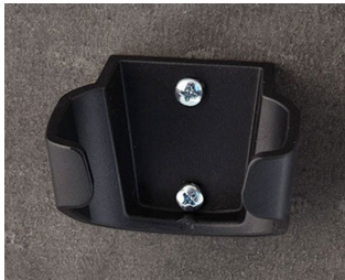
B2904039 Holder L ASA (UL 94 HB) black RAL 9005