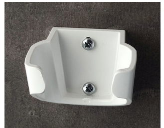
B2904037 Holder L ASA (UL 94 HB) traffic white RAL 9016