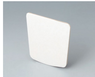
B2904031 Adhesive foil L