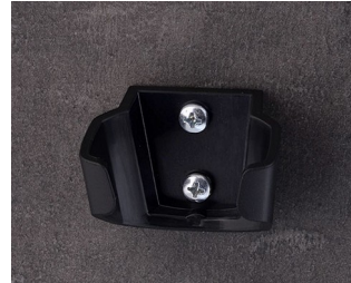
B2902039 Holder S ASA (UL 94 HB) black RAL 9005