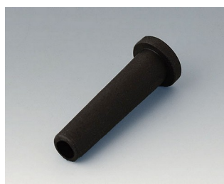
C2353849 Flexible cable grommet Ø 5,3 black