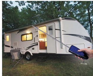
Mobile gas detector