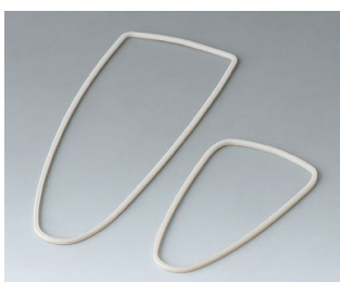
B2904111 Sealing kit L TPV 50A