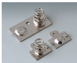
B2904210 Set of battery clips Steel nickel-plated