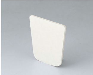
B2902031 Adhesive foil S