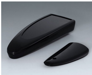
B2804016 STYLE-CASE L PMMA (IR) (UL 94 HB) black RAL 9005 166x64x31mm IP 65 opt., IP 40