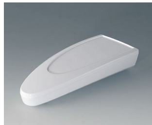
B2804027 STYLE-CASE L ASA (UL 94 HB) traffic white RAL 9016 166x64x31mm IP 65 opt., IP 40