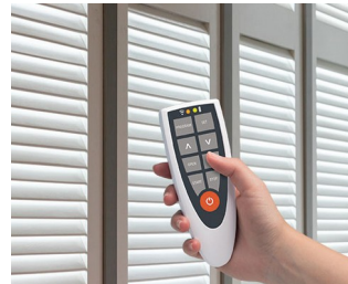
Remote control for room climate