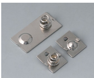
A9190020 Set of battery clips Steel nickel-plated