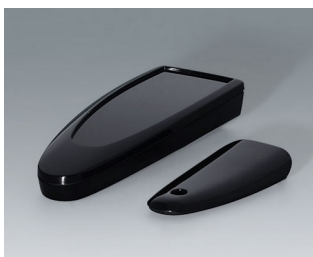
B2802016 STYLE-CASE S PMMA (IR) (UL 94 HB) black RAL 9005 123x48x24mm IP 40