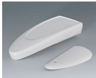
B2804017 STYLE-CASE L ASA (UL 94 HB) traffic white RAL 9016 166x64x31mm IP 65 opt., IP 40