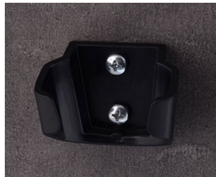
B2903039 Holder M ASA (UL 94 HB) black RAL 9005