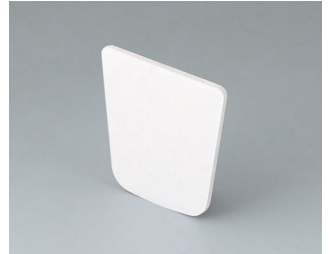
B2903031 Adhesive foil M