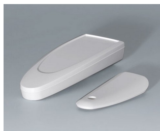
B2802017 STYLE-CASE S ASA (UL 94 HB) traffic white RAL 9016 123x48x24mm IP 40