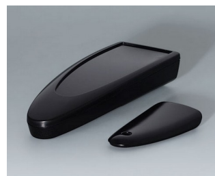
B2803016 STYLE-CASE M PMMA (IR) (UL 94 HB) black RAL 9005 147x56x27mm IP 65 opt., IP 40