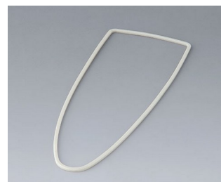
B2904011 Sealing L TPV 50A