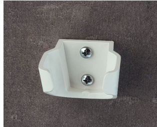
B2902037 Holder S ASA (UL 94 HB) traffic white RAL 9016