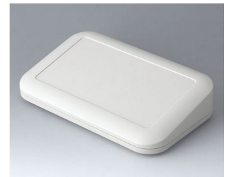
A9466107 EVOTEC 200, Vers. III ASA+PC (UL 94 V-0) off-white RAL 9002 200x124x45mm IP 65 opt., IP 40