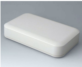
A9481107 EVOTEC 250, Vers. I ASA+PC (UL 94 V-0) off-white RAL 9002 250x155x54mm IP 65 opt., IP 40