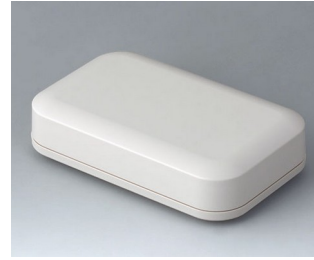
A9441107 EVOTEC 150, Vers. I ASA+PC (UL 94 V-0) off-white RAL 9002 150x93x35mm IP 65 opt., IP 40