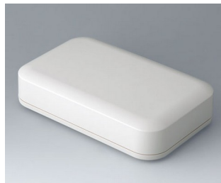
A9461107 EVOTEC 200, Vers. I ASA+PC (UL 94 V-0) off-white RAL 9002 200x124x45mm IP 65 opt., IP 40