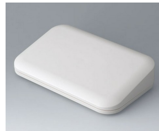
A9465107 EVOTEC 200, Vers. II ASA+PC (UL 94 V-0) off-white RAL 9002 200x124x45mm IP 65 opt., IP 40