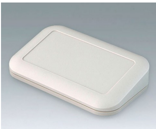
A9446107 EVOTEC 150, Vers. III ASA+PC (UL 94 V-0) off-white RAL 9002 150x93x36mm IP 65 opt., IP 40