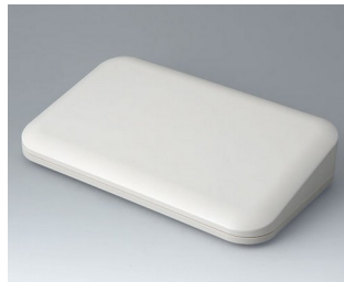
A9485107 EVOTEC 250, Vers. II ASA+PC (UL 94 V-0) off-white RAL 9002 250x155x54mm IP 65 opt., IP 40