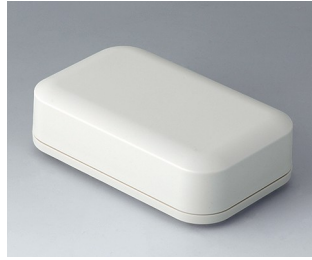
A9433107 EVOTEC 125, Vers. I ASA+PC (UL 94 V-0) off-white RAL 9002 125x78x37mm IP 65 opt., IP 40