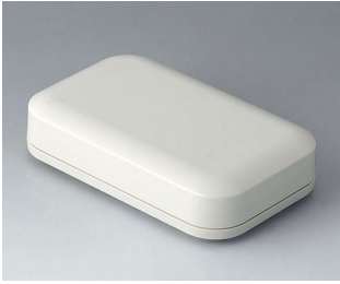
A9431107 EVOTEC 125, Vers. I ASA+PC (UL 94 V-0) off-white RAL 9002 125x78x30mm IP 65 opt., IP 40