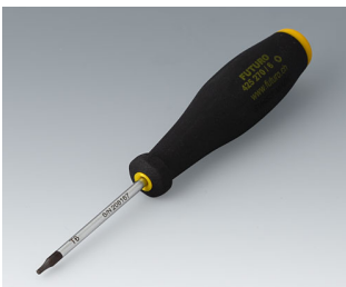
A0399T06 Torx T6 screwdriver