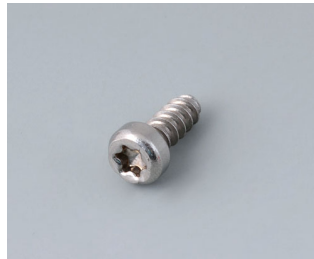
A0325060 Self-tapping screw 2.5 x 6 mm (T8) Stainless steel