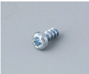
A0304031 Self-tapping screws 2.2 x 5 mm (PZ1)