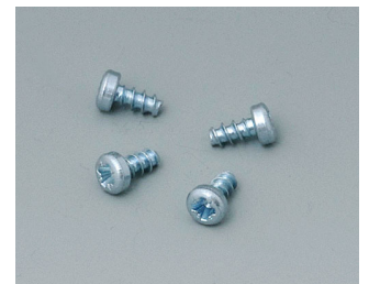
B5111201 Set of screws