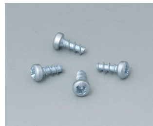
A9199008 Set of screws