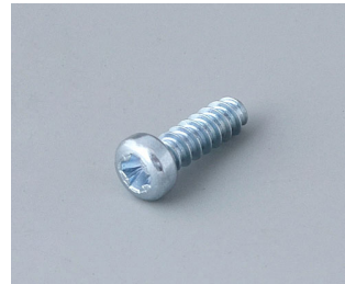
A0325080 Self-tapping screws 2.5 x 8 mm (PZ1)