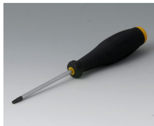
A0399T08 Torx T8 screwdriver