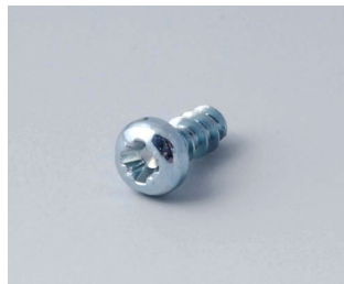
A0305031 Self-tapping screws 2.5 x 6 mm (PZ1)