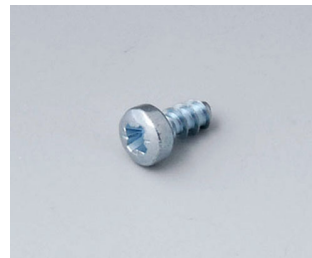
A0306031 Self-tapping screws 3 x 6 mm (PZ1)