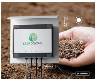
Smart Farming - system for long-term measurements