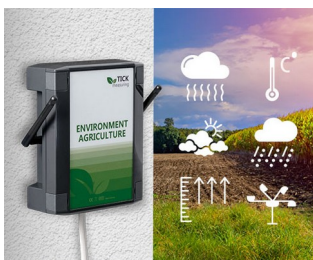
Weather station in agriculture