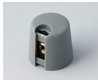
A1016068 TOP-KNOBS 16 PA 6 volcano 16x16mm 6mm