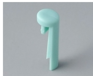
A1101005 Pin PA 6 (UL 94 HB) lagoon