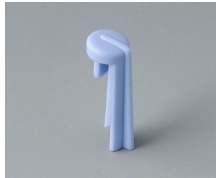
A1105006 Arrow PA 6 (UL 94 HB) sky