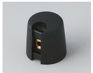
A1016069 TOP-KNOBS 16 PA 6 nero 16x16mm 6mm