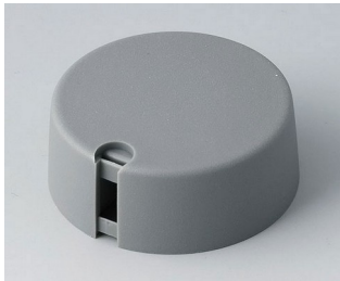
A1040648 TOP-KNOBS 40 PA 6 volcano 40x16mm