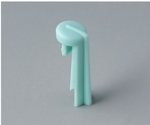
A1105005 Arrow PA 6 (UL 94 HB) lagoon