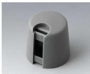
A1016648 TOP-KNOBS 16 PA 6 volcano 16x16mm