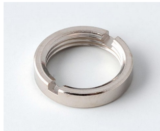
A6210009 Round nut M10 x 0.75