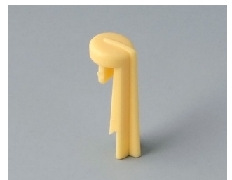
A1105004 Arrow PA 6 (UL 94 HB) beach