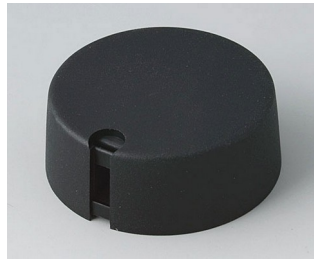
A1040649 TOP-KNOBS 40 PA 6 nero 40x16mm