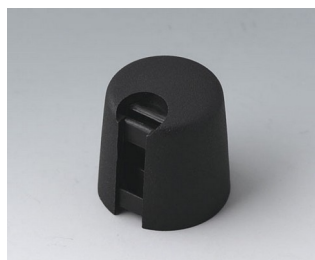
A1016649 TOP-KNOBS 16 PA 6 nero 16x16mm