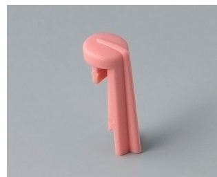
A1105003 Arrow PA 6 (UL 94 HB) coral