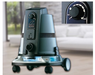
Operating element for a vacuum cleaner