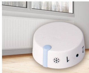
Integrated thermostat for electric storage heaters