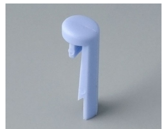
A1101006 Pin PA 6 (UL 94 HB) sky