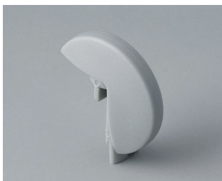
A1103007 Disk PA 6 (UL 94 HB) mineral