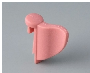
A1104003 Wing PA 6 (UL 94 HB) coral