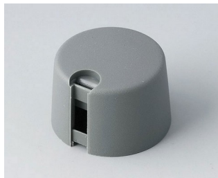
A1024648 TOP-KNOBS 24 PA 6 volcano 24x16mm