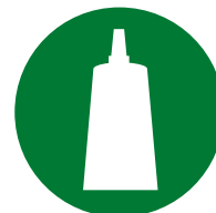
Installation / Assembly of accessories