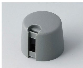
A1020648 TOP-KNOBS 20 PA 6 volcano 20x16mm