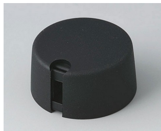
A1031649 TOP-KNOBS 31 PA 6 nero 31x16mm