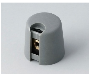
A1016048 TOP-KNOBS 16 PA 6 volcano 16x16mm 4mm