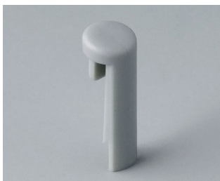
A1101007 Pin PA 6 (UL 94 HB) mineral