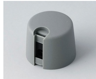
A1020048 TOP-KNOBS 20 PA 6 volcano 20x16mm 4mm