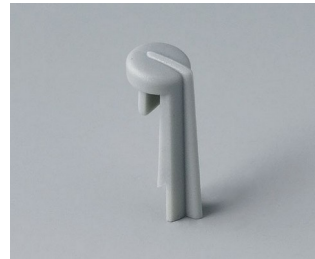
A1105007 Arrow PA 6 (UL 94 HB) mineral