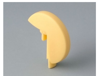
A1103004 Disk PA 6 (UL 94 HB) beach