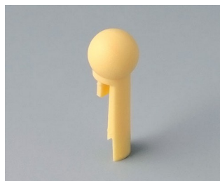
A1102004 Globe PA 6 (UL 94 HB) beach