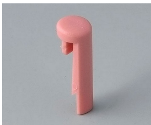
A1101003 Pin PA 6 (UL 94 HB) coral