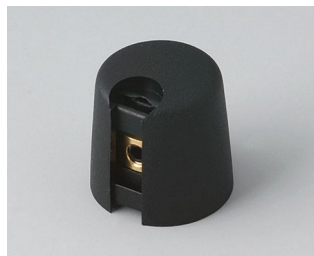
A1016049 TOP-KNOBS 16 PA 6 nero 16x16mm 4mm