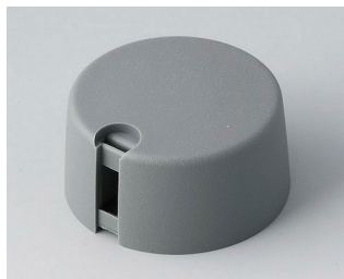
A1031648 TOP-KNOBS 31 PA 6 volcano 31x16mm