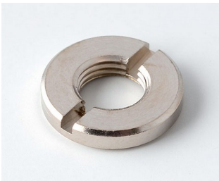
A6207009 Round nut M7 x 0.75