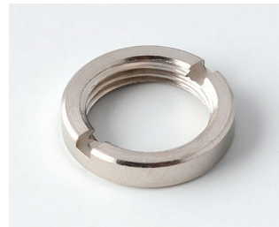
A6295009 Round nut 3/8"-32G

Subject to technical modification without notice. © by OKW Gehäusesysteme, Buchen/Germany.