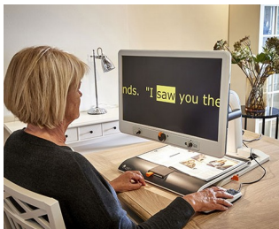
Control knobs for video magnifier