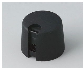
A1020649 TOP-KNOBS 20 PA 6 nero 20x16mm