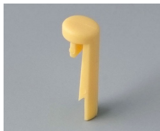
A1101004 Pin PA 6 (UL 94 HB) beach