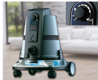
Operating element for a vacuum cleaner