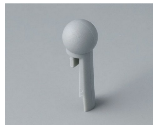
A1102007 Globe PA 6 (UL 94 HB) mineral