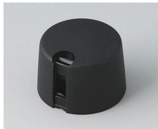
A1024649 TOP-KNOBS 24 PA 6 nero 24x16mm