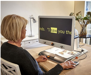
Control knobs for video magnifier

For rotary potentiometers with shaft ends corresponding to DIN 41591 or with flattened ends \varnothing 6/4.6 mm. Measuring and control technology, medical and wellness devices, laboratory equipment, heating and air conditioning, communication equipment, building management, etc.