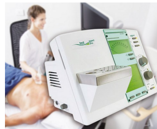
Operating element for a diagnostic device