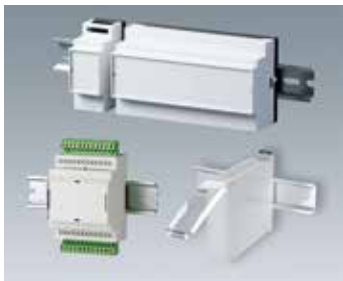
RAILTEC B / C